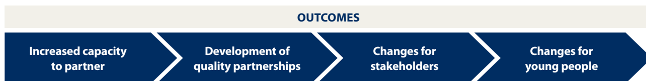
Figure 1 – Outcomes of the Partnership Brokers program

The outcomes for the program are illustrated in Figure 1 and discussed in Table 3 below. The full program logic developed for the Partnership Brokers program is included in Appendix B.